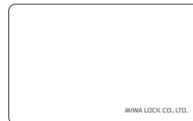
MIFARE Plus 1K (1kbyte)