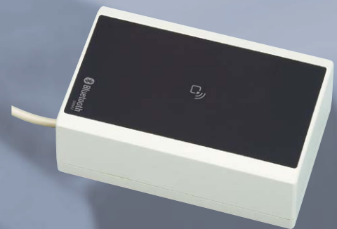
USB Connected BLE encoder (for Mobile key)