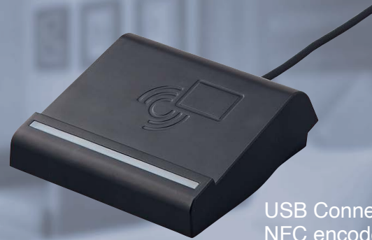
USB Connected NFC encoder